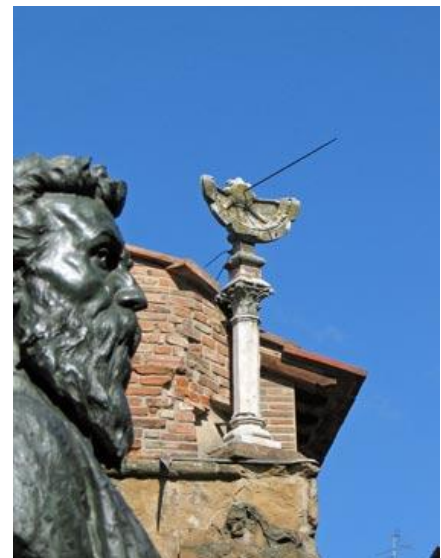
And finally, on the Ponte Vecchio, we find evidence of Leonardo's early experiments with satellite TV

(Web version available with a few more pictures at http://www.duckdown.me.uk/xmas10 )