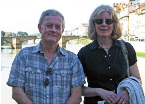
On holiday in Florence

Last winter's freezing weather caused a few casualties in the garden, including a cabbage palm that we had struggled to move two years earlier. It had established well, and as a result, ironically, caused another great struggle to remove. Recent weather doesn't bode well for the banana we planted out this year either, despite its lagging!