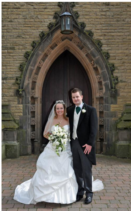
The Happy Couple